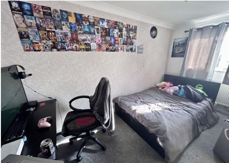
Address: 4 Tower Mews, Lake Hill, SANDOWN, PO36 9EX RRN:

TOTAL FLOOR AREA: 734 sq.ft. (68.1 sq.m.) approx. Whilst every attempt has been made to ensure the accuracy of the floorplan contained here, measurements of doors, windows, rooms and any other items are approximate and no responsibility is taken for any error, omission or mis-statement. This plan is for illustrative purposes only and should be used as such by any prospective purchaser. The services, systems and appliances shown have not been tested and no guarantee as to their operability or efficiency can be given. Made with Hertsplan 12023